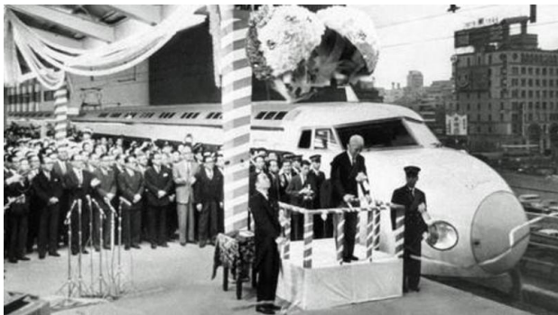
Tōkaidō shinkansen launched at Tokyo Station, 1964

name was an obvious reference to the ancient land route between Edo and Kyōto, the other one (new trunk line) was to distinguish the link, the country's first with standard gauge (1,435 mm) from the old narrow-gauge (1,067 mm) railways built in Japan since the first link between the capital and Yokohama in 1872. 5 As with many other megaprojects, there were some questionable cost estimates, inadequate financing and (what we know now are almost inevitable) cost overruns. In 1958 JNR put the cost at an unrealistically low ¥ 194.8 billion (equal to $ 541 billion in 1958 monies and to at least $4.5 billion in 2014 $) in order to secure the government's funding approval, and the World Bank's eventual loan of just $ 80 million was only about 15% of that grossly underestimated budget. The actual cost reached ¥ 380 billion (just 5% short of doubling the original estimate) and even before the project was completed these large overruns led Sogo Shinji, the President of JNR, and Shima Hideo, the company's VP for engineering, to resign in 1963. But the project was finished on time on October 1, 1964, that is just in time for the Tōkyō Olympics, after five years and five months of construction.