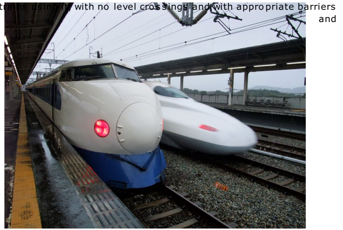
Shinkansen 0 series with Nozomi passing.

with no level crossings and with appropriate barriers and multipurpose inspection trains (they run between midnight and 6 AM when the shinkansen does not operate), with continuous checking of the state of the rails and the bed. Rails are continuously welded (they weigh 60 kg/m) and they are mounted on reinforced concrete slabs. Original specification allowed 2.5 km for the radius of curves and the maximum gradient of 2%, but for new, faster trains the minimum curve radius is 4 km and the maximum slope is 1.67%. Electricity is supplied as 25 kV AC at 60 Hz and it is drawn from catenary wires made of copper or copper-clad steel. Unlike many other rapid trains, shinkansen trains do not have a locomotive (or locomotives). 7