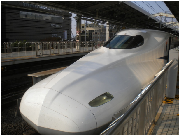
Nozomi 700 Series in November 2014.