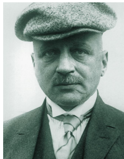
Fritz Haber: discovered a way of converting nitrogen in the atmosphere into ammonia ...

Nitrogen is abundant in the atmosphere, but in a form that is difficult to extract; only a few microbes and plants have the capacity to do this. Yet, thanks to their efforts over aeons of time, a whole planetary ecology can now be sustained. This organic nitrogen will even