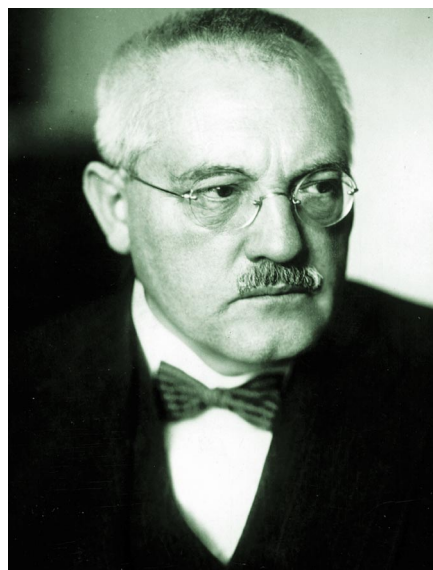
... And Carl Bosch: had faith that the process could be made to work commercially.

The central theme of Enriching the Earth tells of Haber's struggle to make hydrogen gas ( H_2 ) react directly with nitrogen gas ( N_2 ) to form ammonia ( NH_3 ), and of Bosch's faith that the process could be made to work commercially. Bosch then convinced the German chemical company BASF to invest in it. This was an industry born. But it was not immediately seen as the answer to the world's food