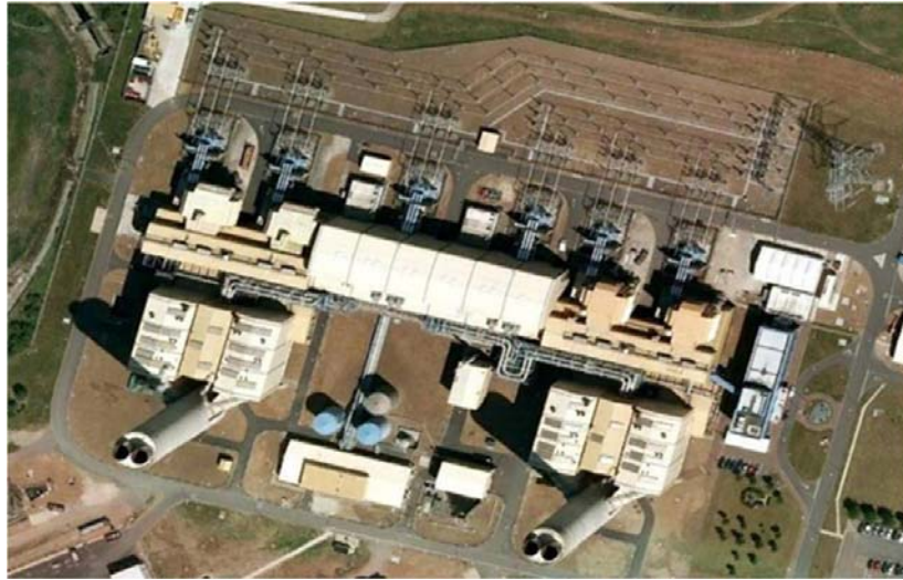
Didcot-B, 1,360-MW e gas turbine electricity generating plant in Oxfordshire (trees and cars provide the scale).

turbine plant was built between 1994 and 1997 within a larger pre-existing site of Didcot-A, a 2-GW e coal-fired station completed in 1968. Construction of that large coal-fired plant had created a great deal of local opposition, but a gas-fired plant of more than two-thirds of the coal plant's capacity was accommodated without any problems within the original plant's area, occupying less than 10% of the entire site. Alternatively, gas turbine plants can be fitted into odd spaces within urban areas.