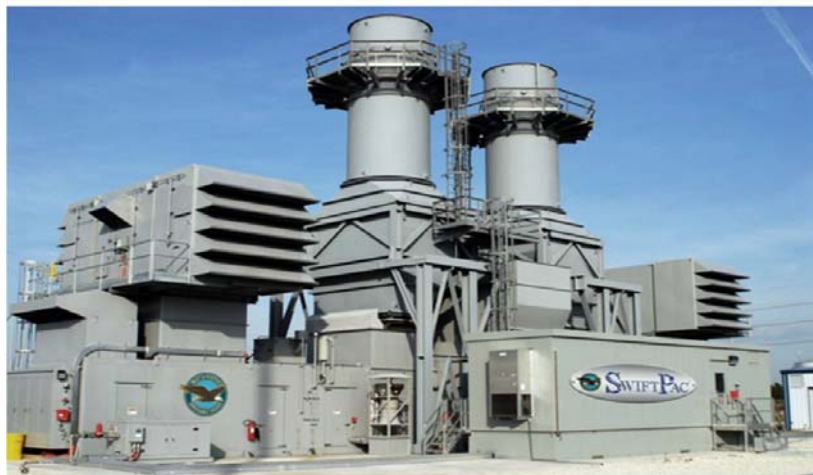
P&W's SwiftPac, 60 MW gas turbine with a minimal footprint: control trailer in the right foreground; fire extinguisher on the front left wall indicates the scale.

A 25-MW mobile gas turbine can occupy as little as 140 m 2 ; with its control trailer, access roads, fuel and electricity connections and a perimeter buffer, it could still fit within a 40 x 15 m rectangle. P&W's 60 MW SwiftPac (and its control housing) erected on concrete foundations needs less than 700 m 2 and it can be ready to run in 21 days.