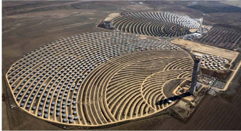
Abengoa's two large CSP plants near Sanlúcar la Mayor (Sevilla), PS10 in operation and PS20, in the foreground, shown still under construction.

area taken up by the heliostats alone, and a bit more than 4 \text{ W/m}^2 if the entire area is considered. PS20 (completed in 2009) is nearly twice the size ( 20 \text{ MW}_p ; 48.6 \text{ GWh} or 175 \text{ TJ/year} at average power of 5.55 \text{ MW} and capacity factor of nearly 28%). Its mirrors occupy 150,600 \text{ m}^2 and hence the project's heliostat power density is, at 36.85 \text{ W/m}^2 , identical to that of PS10 but, with its entire site covering about 90 ha, its overall power density is higher at about 6 \text{ W/m}^2 .