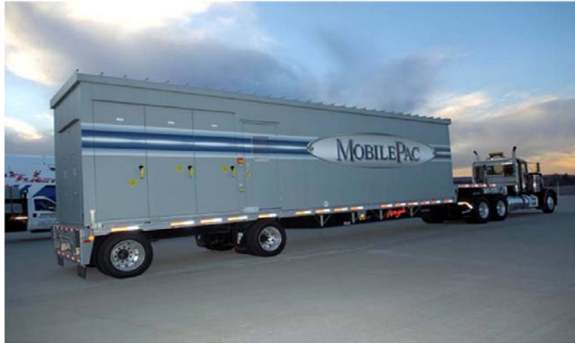
P&W's MOBILEPAC, 25 MW e (a modified FT8 jet engine) on a trailer: the most compact and nearly instantly installable multi-MW electricity generator on the market.

A 25-MW mobile gas turbine can occupy as little as 140 m 2 ; with its control trailer, access roads, fuel and electricity connections and a perimeter buffer, it could still fit within a 40 x 15 m rectangle. P&W's 60 MW SwiftPac (and its control housing) erected on concrete foundations needs less than 700 m 2 and it can be ready to run in 21 days.