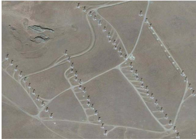
Spacing of wind turbines and access roads at the Altamont Pass wind farm in California.

Actual power densities vary with average wind speeds and turbine sizes. Altamont, America's pioneering large wind farm in California, rates only 0.6 \text{ W/m}^2 , Puget Sound Energy's Wild Horse (with a high capacity factor of 32%) has power density of 2 \text{ W/m}^2 . The world's largest offshore wind installation, London Array in the outer Thames estuary – designed to have a capacity of 1 \text{ GW}_p , annual generation of 31 TWh (354 MW) and an area of 245 \text{ km}^2 – will have power density of just 1.44 \text{ W/m}^2 . A good approximation of expected power densities for large scale wind generation (year-round average, not the peak power) should not be thus higher than 2 \text{ W/m}^2 . If 10% of the US electricity generated in 2009 (395 TWh or 45 GW) were to be produced by large wind farms their area would have to cover at least 22,500 \text{ km}^2 , roughly the size of New Hampshire.