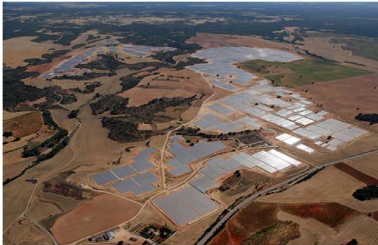
Olmedilla PV plant with 162,000 panels and 60 MW p generates electricity with average power density less than 9 W/m 2 of its total area.

The largest solar PV parks thus generate electricity with power densities that is roughly 5-15 times higher than for wood-fired plants but that is at best 1/10 and at worst 1/100 of the power densities of coal-fired electricity generation. Again, if only 10% of all electricity generated in the US in 2009 (395 TWh or about 45 GW) were to be produced by large PV plants, the area required (even with average power density of 8 W/m 2 ) would be about 5,600 km 2 . No dramatic near-term improvements are expected either in the conversion efficiency of PV cells deployed on MW scale in large commercial solar parks or in the average capacity factors. But even if the efficiencies rose by as much as 50% within a decade this would elevate average power densities of optimally located commercial solar PV parks to no more than 15 W/m 2 .