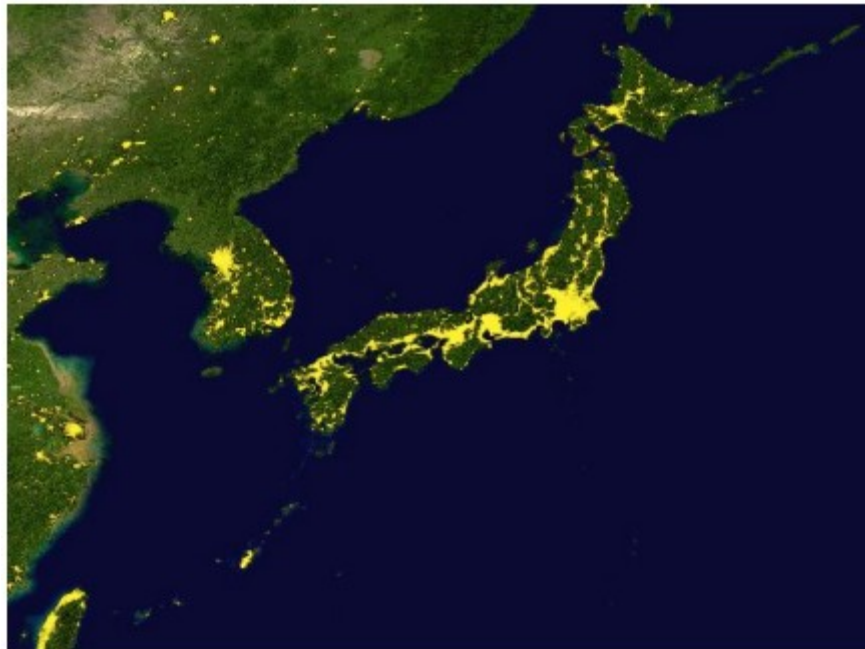
Fig. 3. Nighttime satellite image of Japan’s lights superimposed on a daylight satellite image of the archipelago and its eastern neighbors.

There is little doubt that the Japanese would illuminate their households even more if electricity prices were lower. Japan’s national electricity market was expanded in 2005, but (unlike in many other countries) large (and vertically integrated) utility companies (dominated by the giant Tokyo Electric) do not allow their customers to switch to other suppliers. [15] Even so, the mere threat of further market reforms has helped to reduce electricity prices, albeit only modestly: Between 2000 and 2005 they fell by about 5%. For decades the combination of increasing intensity of outdoor lighting and high densities of Japan’s residential and industrial areas, and of the country’s transportation corridors, has created large bright patches of light across large parts of the archipelago seen on nighttime satellite images (Fig. 3). [16] Good news is that, regardless of what is going on in the outside world, there is now also considerably more light inside the Japanese homes.