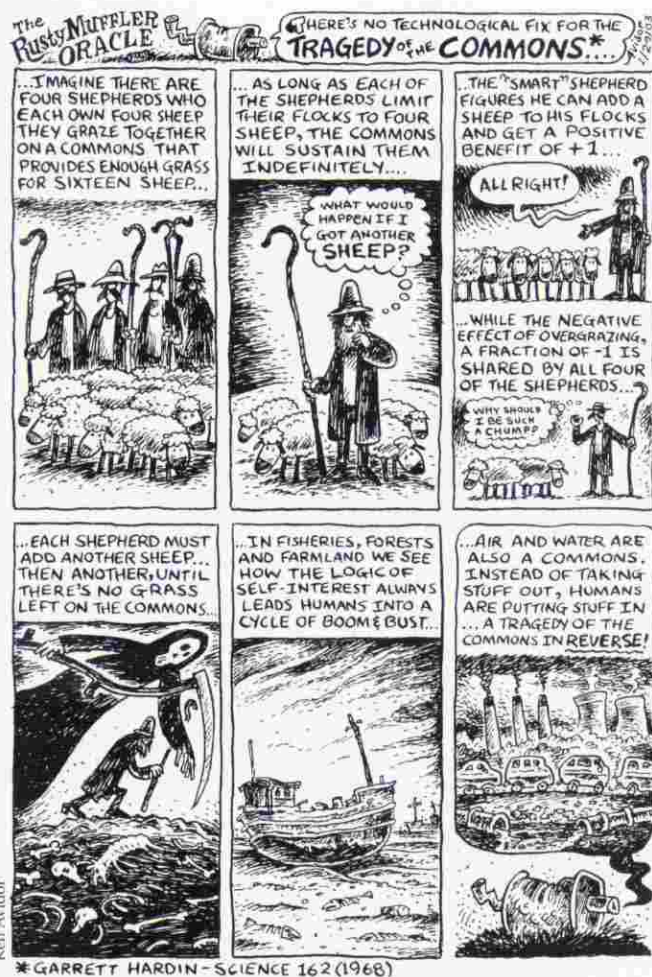
Figure 2. Hardin's parable of the tragedy of the commons served as fodder for a cartoon that appeared in the Twin Cities Pulse in January 2003.

not to mention the costs of education and other social services to the child for 18 years. So: when a woman elects to have a child, she is committing the community to something like $100,000 in expenses for the bearing and rearing of that child. Is it wise to extend individual rights that far?" Here he tops even the draconian family planners of China. As a former demographer, I am not afraid, as Hardin was, that we will ever get to 50 billion people. (Most current forecasts put the likely maximum even below 10 billion.) And I see excessive consumption as a much greater threat to the integrity of the biosphere than a temporarily large, but eventually self-regulating, global population.