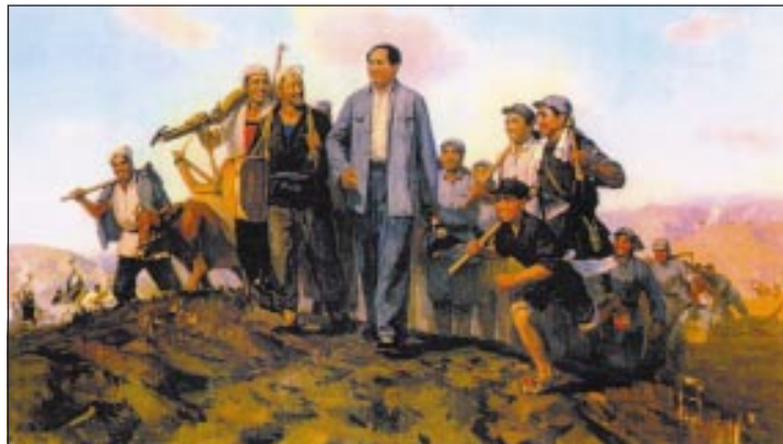
Peasants were forced to abandon private food production

The true extent of the famine was not revealed to the world until the publication of single year age distributions from the country's first highly reliable population census in 1982. These data made it possible to estimate the total number of excess deaths between 1959 and 1961, and the first calculations by American demographers put the toll at between 16.5 and 23 million. 9 More detailed later studies came up with 23 to 30 million excess deaths, and unpublished Chinese materials hint at totals closer to 40 million. 10-12 We will never know the actual toll because the official Chinese figures for the three famine years greatly underestimate both the fall in fertility and the rise in mortality and because